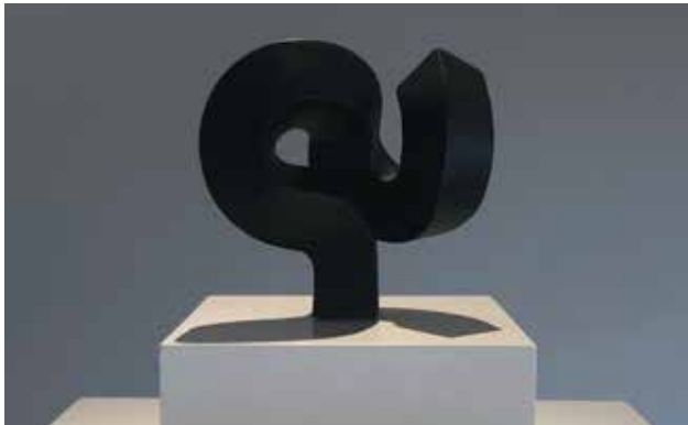
Clement Meadmore, Delaunay's Dilemma . Model courtesy of Meadmore Sculptures LLC.

Clement Meadmore is represented in Lynden's permanent collection by two exuberant monumental outdoor works, Upstart (1967) and Double Up (1970). Clement Meadmore: The Models continues our exploration of the work and creative processes of artists in our collection, many of whom were also making smaller sculpture, furniture, or works on paper. In this exhibition, organized in collaboration with Meadmore Sculptures, we display eight models—some of them used to this day to fabricate Meadmore's large-scale works—as well as an etching. These works were often executed at a variety of scales, and the exhibition includes a slightly larger bronze version of Hobnob , also represented by a polymer resin model. Watch for additional public programming in 2019.